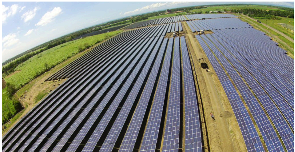
Actual site photos